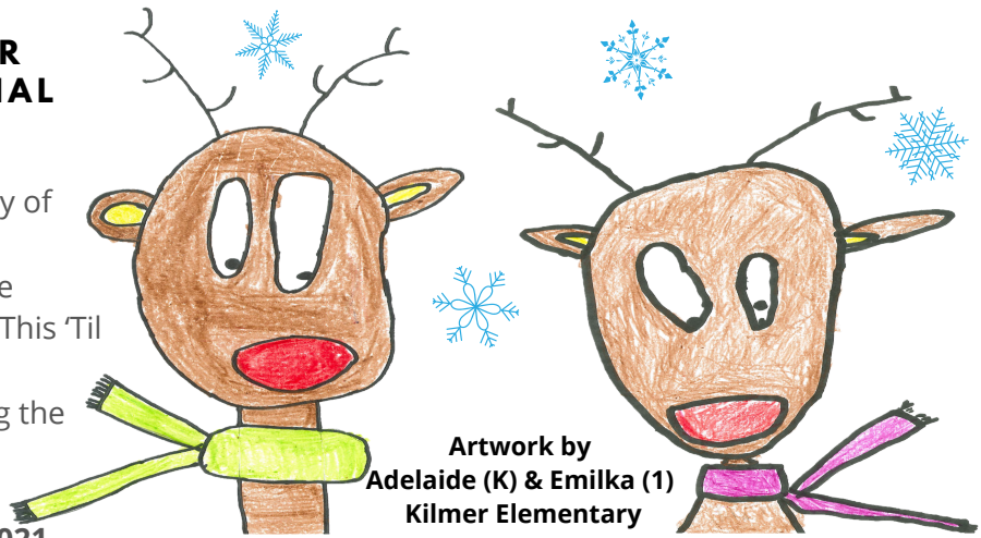
Artwork by Adelaide (K) & Emilka (1) Kilmer Elementary

After already postponing due to Covid, this wedding reception was determined to go ahead, despite the groom coming down with food poisoning. They made a stand in out of a steamer, pool cues, a suit, and an iPad: Groom misses wedding with food poisoning, bride improvises | Toronto Sun